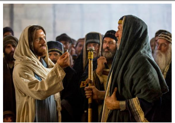
The Pharisees and some scribes gathered round Jesus

Look at www.ThePopeVideo.org for more information